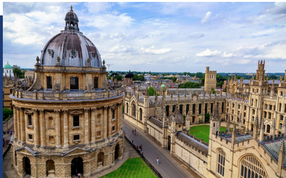
Radcliffe Camera, Oxford