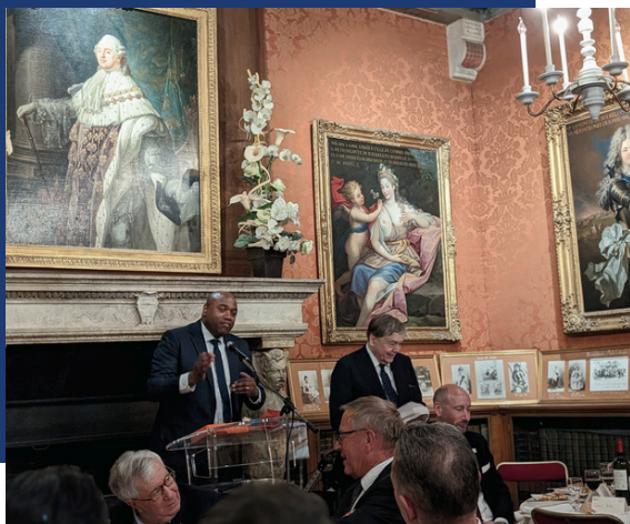
Launching of the Entente Cordiale Prizes, April 2024, Chateau de Breteuil

Our Entente Cordiale Prizes are honoured to benefit from the High Patronage of the President of the Republic, Mr Emmanuel Macron, and of the support of His Majesty, King Charles III.